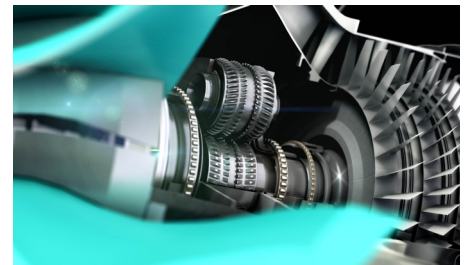
Figure 1. Granta MI supports Rolls-Royce in managing their cutting-edge materials.